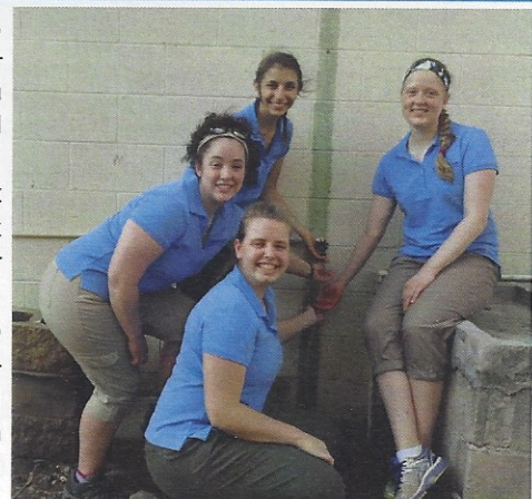
Students in front of clean water source from newly installed unit.