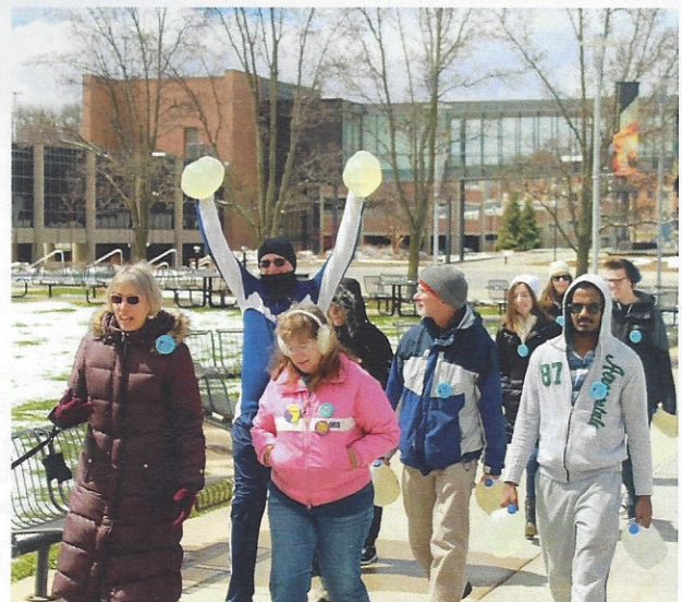
Participants in action at Walk for Water Kalamazoo 2016